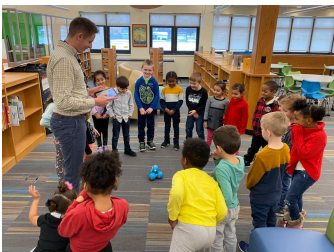
Dash the robot!

All students at Windermere are learning about Computer Science and coding as we celebrate the Hour of Code. Learning Computer Science helps nurture problem-solving skills, logic and creativity. By starting early, students will have a foundation for success in any 21st-century career path. Coding can be electronic or unplugged - the very basics of coding is simply sequencing a task step-by-step!